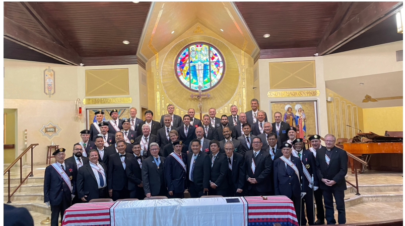
4th Degree Exemplification Ceremony - October 1, 2022

I am looking forward to working with you all.